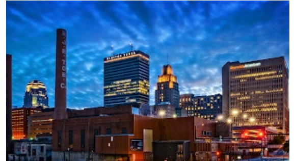
Kimpton Cardinal Hotel, Winston-Salem, NC

Who: NCALC members and non-members alike are encouraged to register and participate for the convention and to invite their colleagues and friends of the Fabricare Industry, including spouses and significant others, to join us. Program content is designed primarily for owners, managers, and other key employees of the Fabricare Industry.